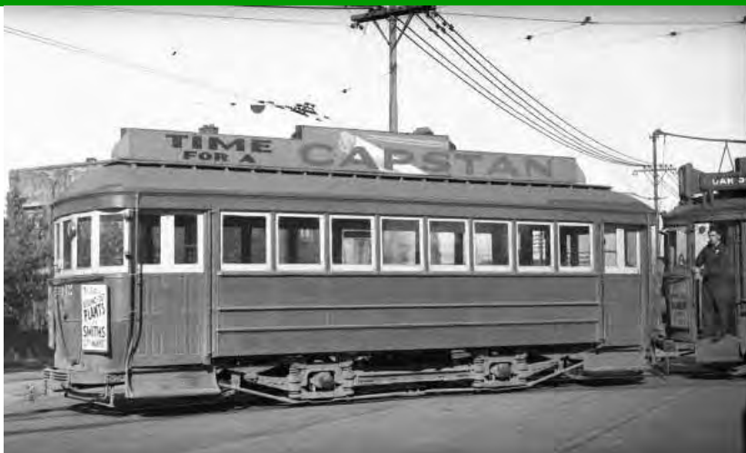
ABOVE: 'Standard' trailer 142 being shunted back to Falsgrave Street depot after workshop attention. Clearly visible are the later platform doors fitted to all 'Standards' after 1922.