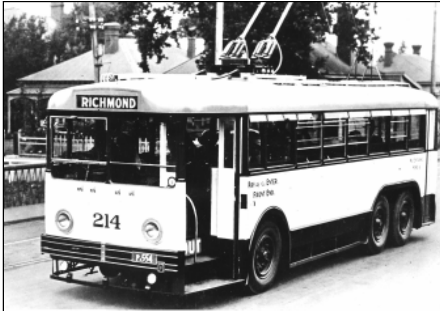
Ransomes trolleybus en route to Richmond in the early days.

facing frogs on the system but at the North Parade/ New Brighton Road corner (Marshland Road terminus) the overhead on the turning circle was continuous but a pole change was necessary for the seldom used link to the North Beach route. Fitzgerald Avenue was then two parallel streets so North Beach buses travelled both ways on the western side and at the Cashel Street/Fitzgerald Avenue intersection the North Beach drivers had to change poles, helped at night by extra manually switched street lighting used also for the overhead change from Cashel Street to the depot. Initially overhead was also fitted so buses could turn east from Fitzgerald Avenue into Cashel Street and also at Stanmore Road turning west into Worcester Street. Both these involved two pole changes. All buses returning to the depot from the terminuses had to travel via the Square. At least until 1942 the interior lights on the English Electric buses were not battery operated so we