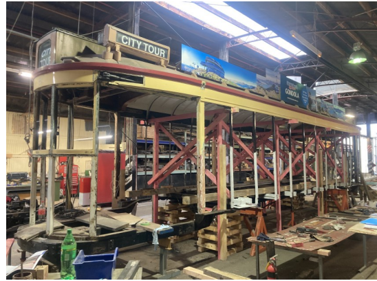
178 LH side all stripped.