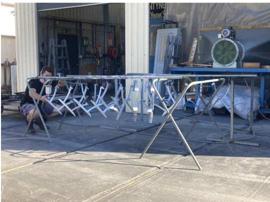
Alan Hinman spray painting the seat frames