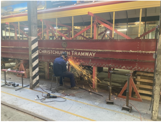
Leighton grinding off old rivets