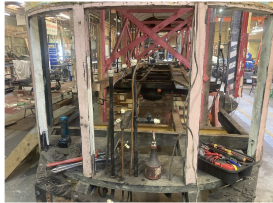
The back cab all stripped ready for the next stage.