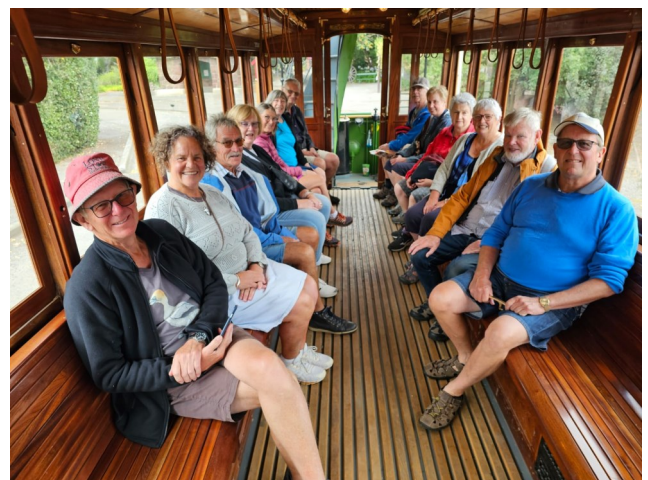
The group onboard DD26