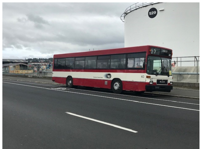
MAN 612 in between duties in Dunedin on a cruise ship passenger transfer shift.

With the heavy vehicle compliance people on the prowl, OHBS & THS drivers are being asked to be extra vigilant in their daily bus checks