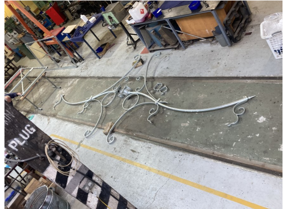
The newly constructed Bracket arm for the Village