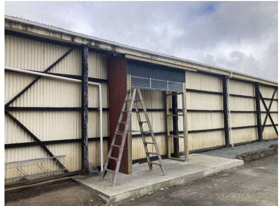
The new Sawdust extractor room beside TBI