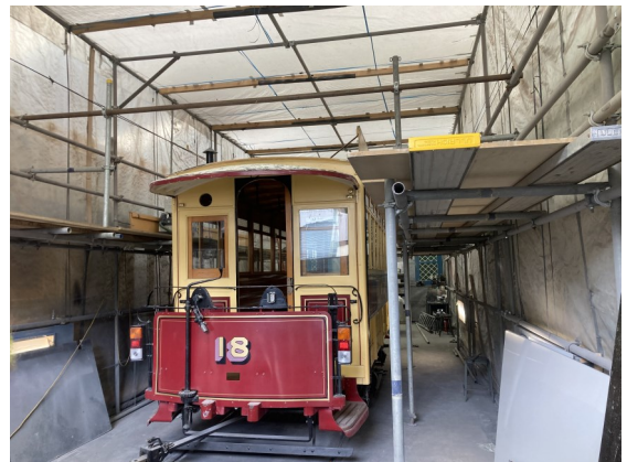
Trailer 18 in the paint tent with the scaffold around it allowing access to the roof.