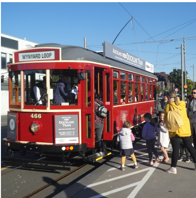
MMTB X466 on the Dockline tramway in Wynyard Quarter in Central Auckland .