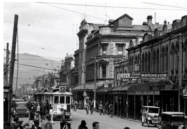
A Boon drop centre car in Colombo st outside Ballantynes.