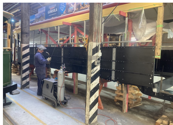
Brian welding up the panel seams before riveting.