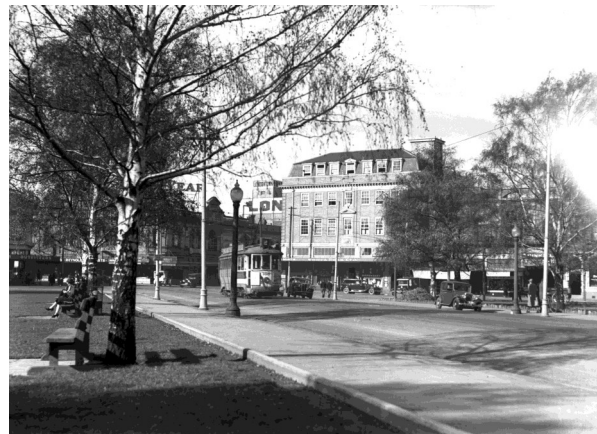
Hills car heading through Victoria Square in 1936.