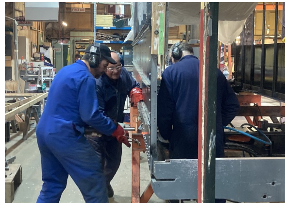
The lads gearing up to rivet one of the approx 1240 rivets that were installed in a week on both sides. A great effort.