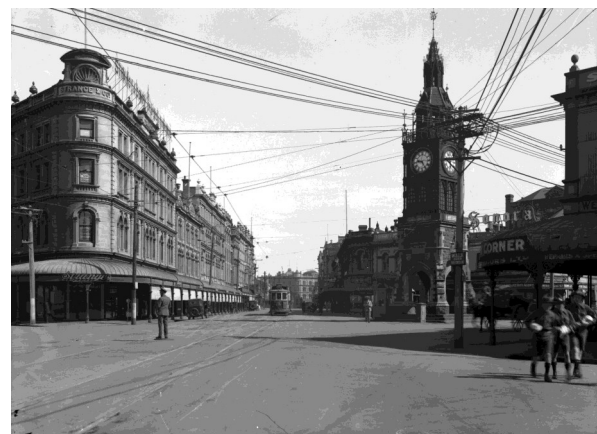
Lower High st with a Boon drop centre car on route 15.