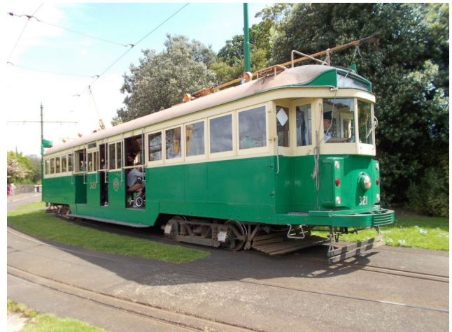
MMTB W2 321 on the Western Springs tramway.