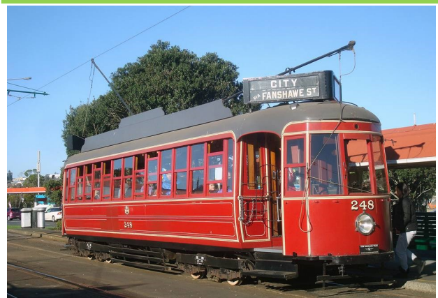
ATB Streamliner 248 on the Western Springs tramway at Motat.